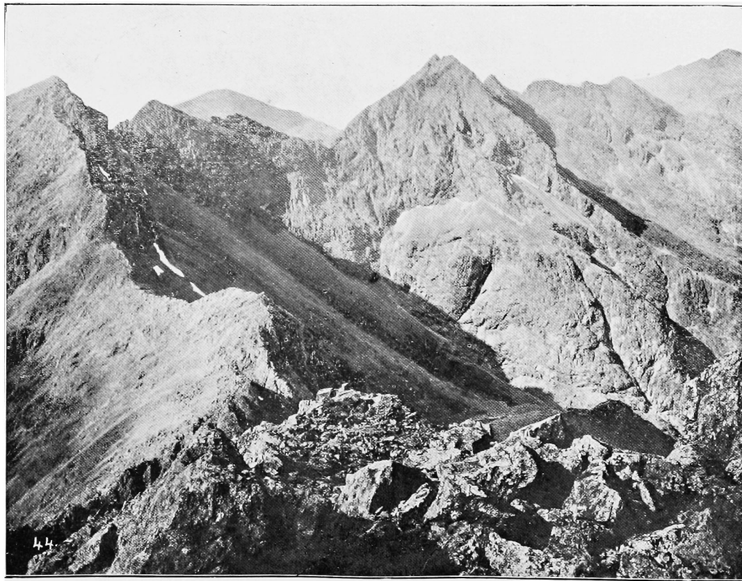
VIEW FROM SGURR DEARG.