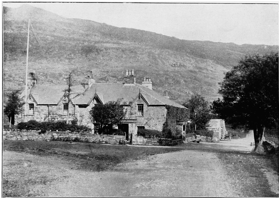
PEN Y GWRYD.