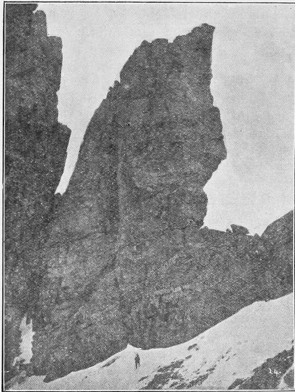
THE BHASTEIR TOOTH. (NORTH FACE.)

the "Inaccessible Pinnacle" on Sgurr-Dearg. Had lunch by the small loch at the head of Corrie Labain. Struck up the edge of the scree, hitting the ridge to the east of the "Pinnacle." Followed the arête, which we found very rotten and loose, to the west ; traversed to the right hand of the summit of Sgurr-Dearg ; descended a chimney, and rounded a corner to the left,